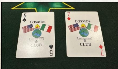
The Cosmos Club of Fair Lawn, Inc. made a statement at the event with our logo proudly displayed throughout the event.