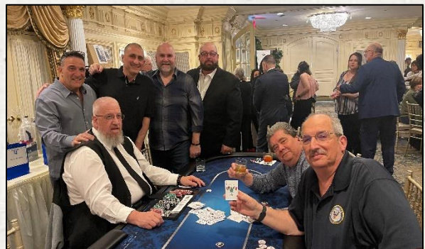
Cosmos Club Members & Women's Auxiliary Members are enjoying an evening at The Brownstone on March 28, 2025, to raise even more funds and awareness for the cause.